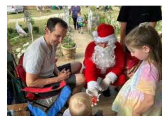
Michelago Magpie 34 – 1 Feb. 2025 – MRCA Inc.