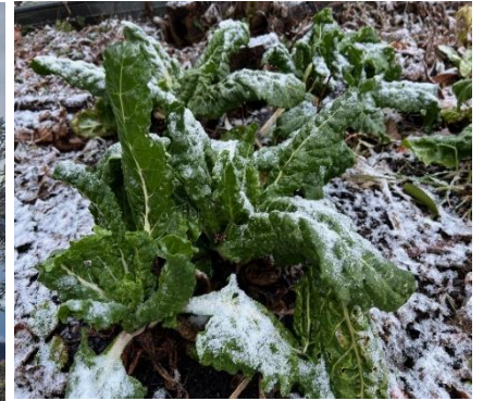
Above: Silvered beet