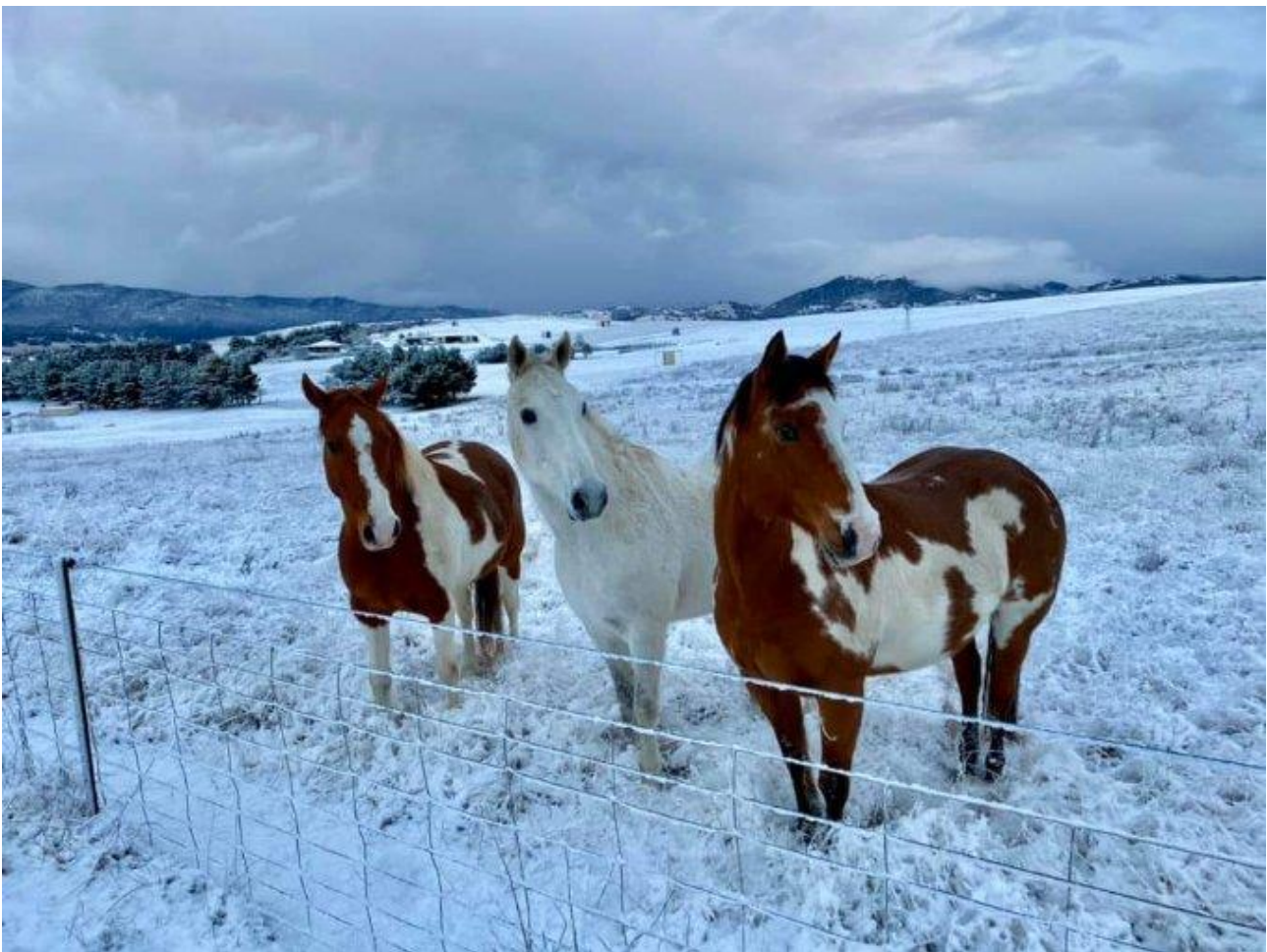
Sculpture and horses