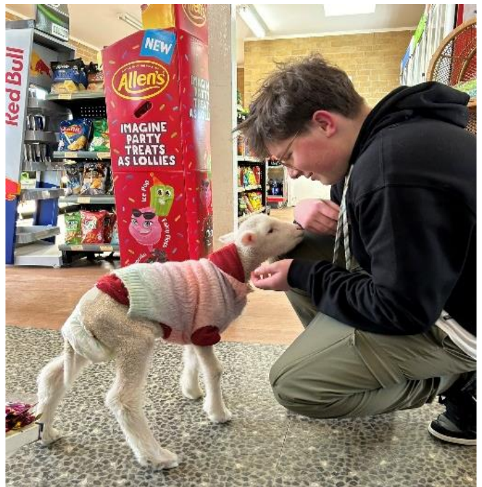
Only in Michelago.