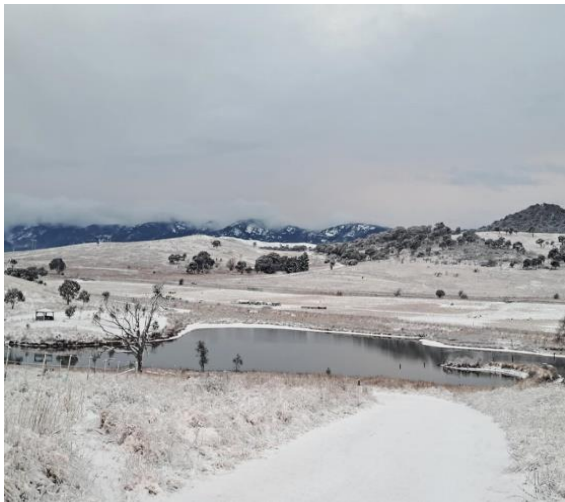
Clearview Rd views (Gary Morris)