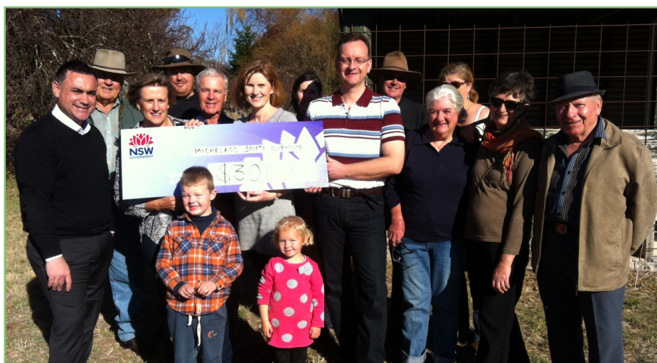
Presentation of the tennis clubhouse grant to the Michelago community

Our aim is to turn the railway station into a photo and memorabilia gallery of the history of Michelago as well as being available as a place for local community groups to meet. There is an active group of Funny Old Active Ladies, (FOALs) from the community who will be the first to enjoy the upgraded facility. There they will meet and share a cuppa together while engaging in craft and other activities. We will keep you updated on progress of this project.