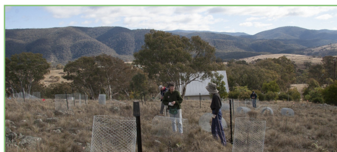
Landcare planting day at Illilanga, photo by Sandra Lauer

The Group was successful in getting a Community Action Grant, under the Australian Government's "Caring for our Country" initiative, to plant 700 Allocasuarina verticillata trees around Michelago on the ridges overlooking the Murrumbidgee River. These Drooping She-oaks are the main food source for the beautiful Glossy Black-Cockatoo.