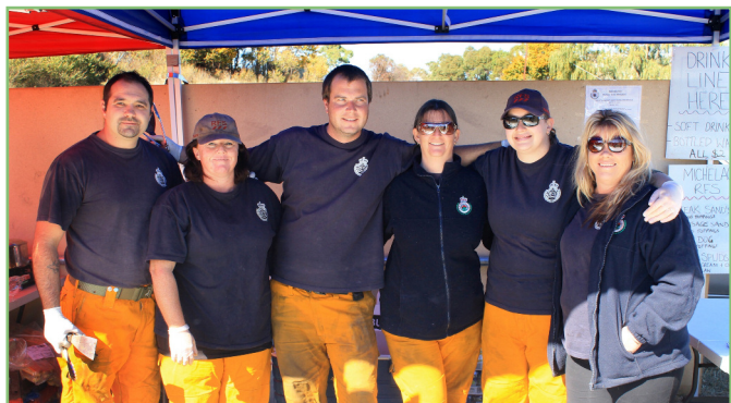
Michelago Rural Fire Brigade Mayfair BBQ team

Once again we had a successful Mayfair with beautiful weather. It is, of course, 'Always Sunny in Michelago' and it did not let us down this day. The participating community groups collectively raised over seven thousand dollars. These funds will in turn benefit the whole community. The Michelago Rural Fire Brigade put on an outstanding BBQ as always. They provided a wide selection of delicious food including burgers, sausages and baked potatoes.