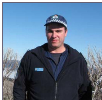
by S/C Charles Gannon, Michelago Police

With the onset of the winter season and the increase in highway traffic I again urge all road users to drive with caution. Unfortunately some have not heeded this warning over the past few months, with an increase in motor vehicle collisions. In April an unaccompanied learner driver crashed and rolled a number of times while travelling down Mount Livingstone Road. Both driver and teenage passenger were not wearing seat belts. As a result of the collision the passenger sustained serious and permanent leg injuries. The driver was subsequently issued a summons to attend Queanbeyan Court. Also in April, a male driver was stationary on the highway waiting to turn right into a driveway when a vehicle approaching from behind failed to stop and collided with the stationary vehicle causing extensive damage to both vehicles.