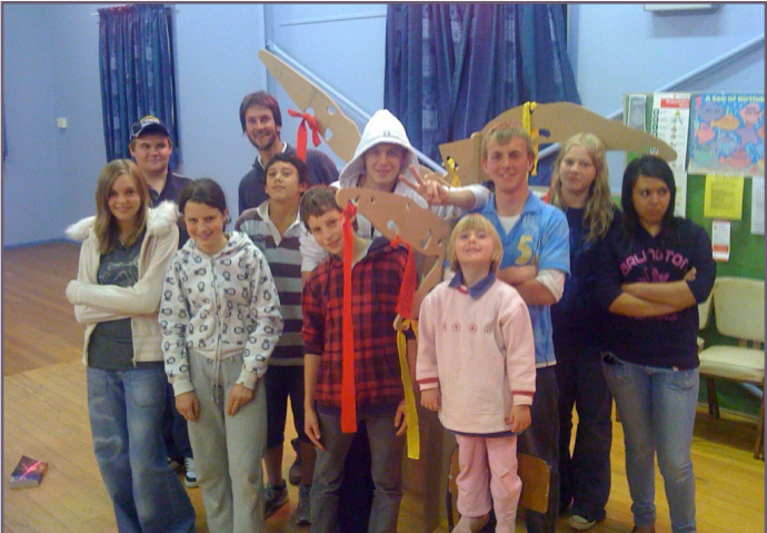
Michelago Youth Group at the Community Hall

fun games, chilling, Rock Band, sport and learning about God. i really enjoy it!