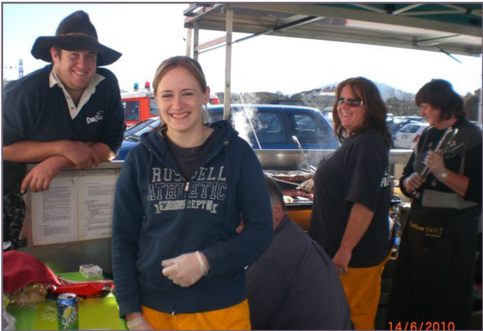
MRCA-MRFS BBQ - Bunnings Tuggeranong - 14th June

I have continued to attend local associations’ committee meetings and events to listen to their concerns and assist where possible in furthering their interests. I would like to take this opportunity to congratulate the MRCA for organising and running a very successful Mayfair on Sunday 2 May and for providing the community and visitors a great day of entertainment and