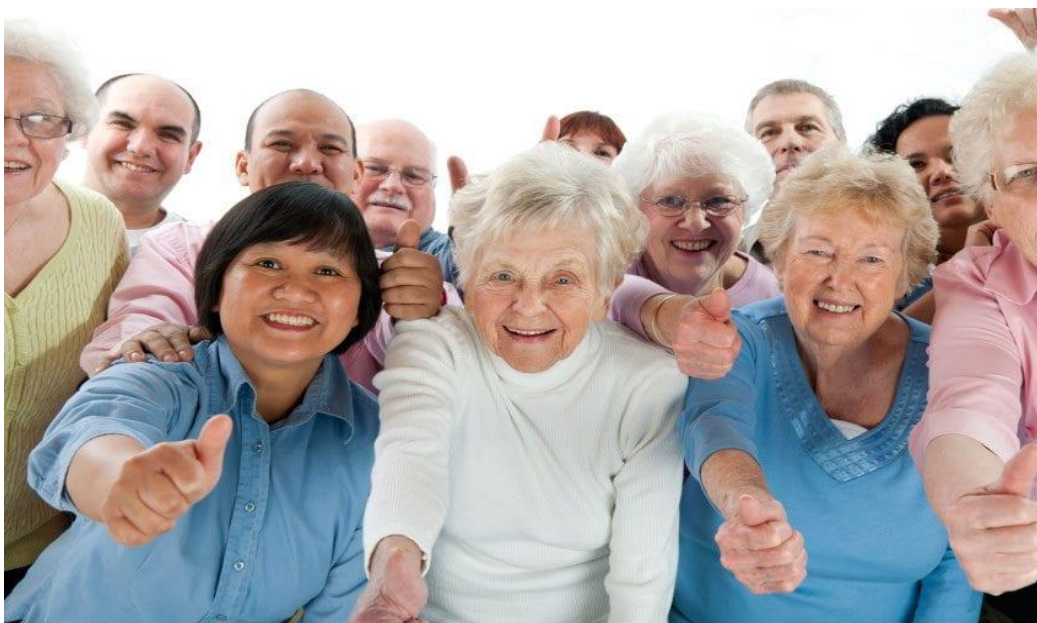
Creative Commons image

https://www.snowymonaro.nsw.gov.au/News-and-Media/News-articles/Aged-care-and-community-services-survey