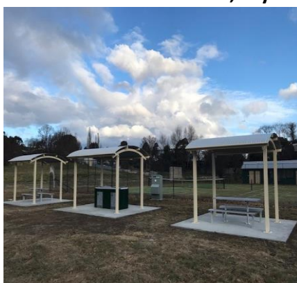
Two long views, and (R) it works!