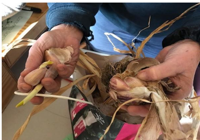
Above: Bredbo Lyn's huge red garlic.