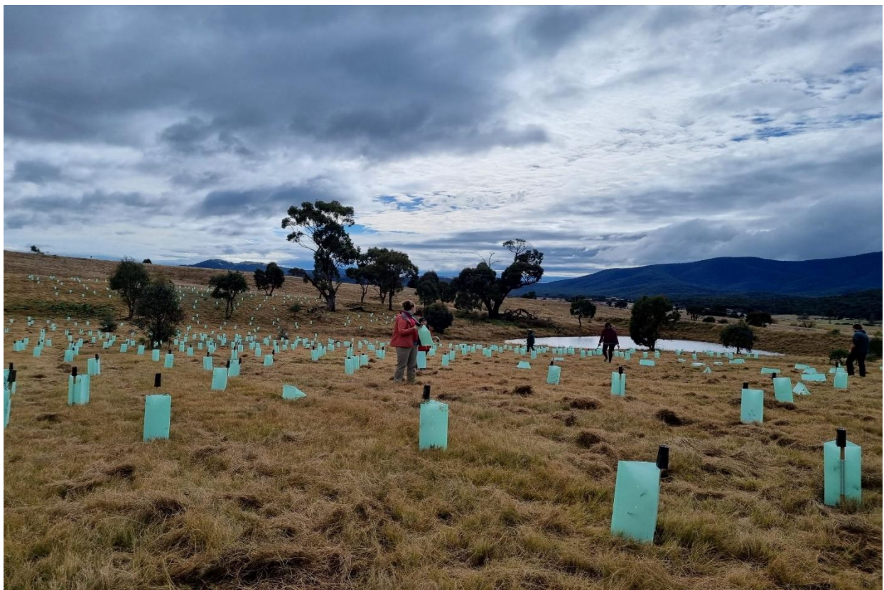
Planting activity for the recent tree grant, showing about half done on this property.

* https://intrepidlandcare.org/ ** https://www.lls.nsw.gov.au/