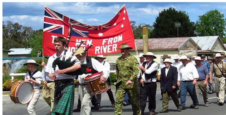
Re-enactment – Men from Snowy River march starting in Delegate, November 1, 2015

Is the banner at Michelago that replica or one of several created for the event?