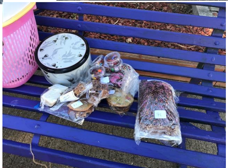
Left: Michelago School's P&C cake stall was, as usual, a huge success. Above: all that was left at 2pm.