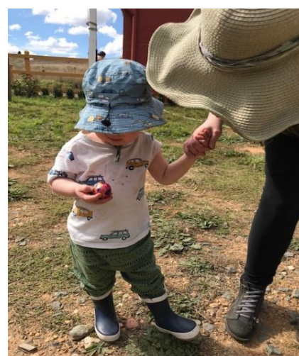
Someone very shy!