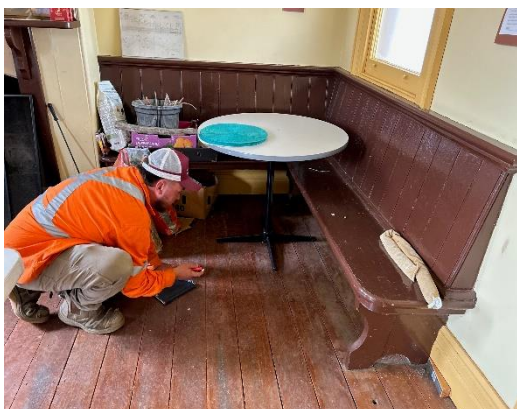
L: No termites

As he does not report to the MRCA, which only leases the station buildings from UGL, the Committee has not seen his report.