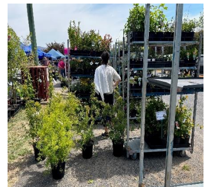
Gardeners had a wide choice: Feel Well Farm, Tablelands Trees & Shrubs, Landcare, and Caitlin & Mitch's seedlings.