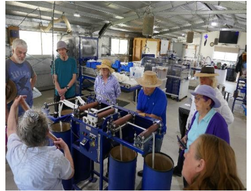
L: Meet the alpacas. R: Learn about processing the fibres.

Sunday 29 October. The Southern Harvest Association held two farm visits to local farms. One was to Pacawoolly in Michelago to meet and learn about alpacas and the other to Boston Fine Fibres in Burra, one of a handful of alpaca fibre mills in Australia.