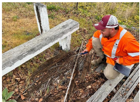
R: Termite nest south of the platform.