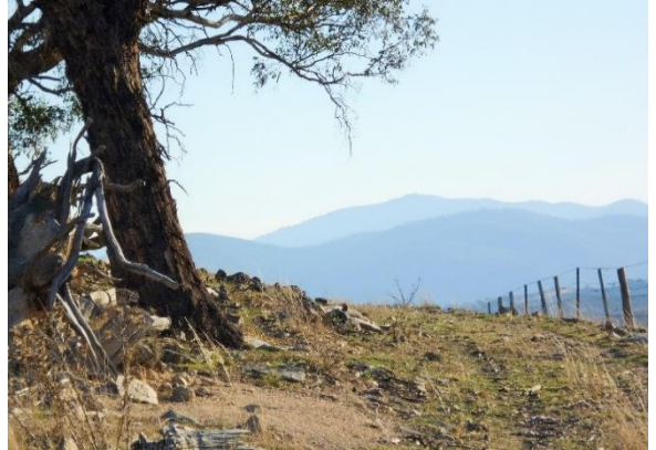
Cassidy Track

Council planning staff will be visiting Michelago on 3 December in the Hall, 10.30—12.30 to consult with the community on the planning documents, so you can discuss the proposals, ask as many questions as you need and leave feedback.