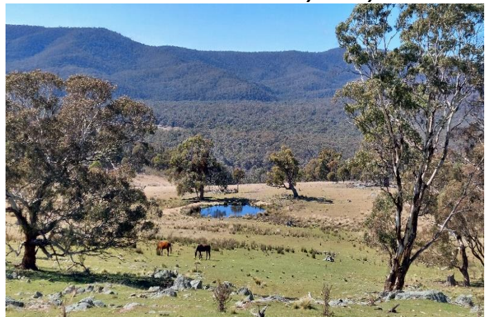
Near Burra Road