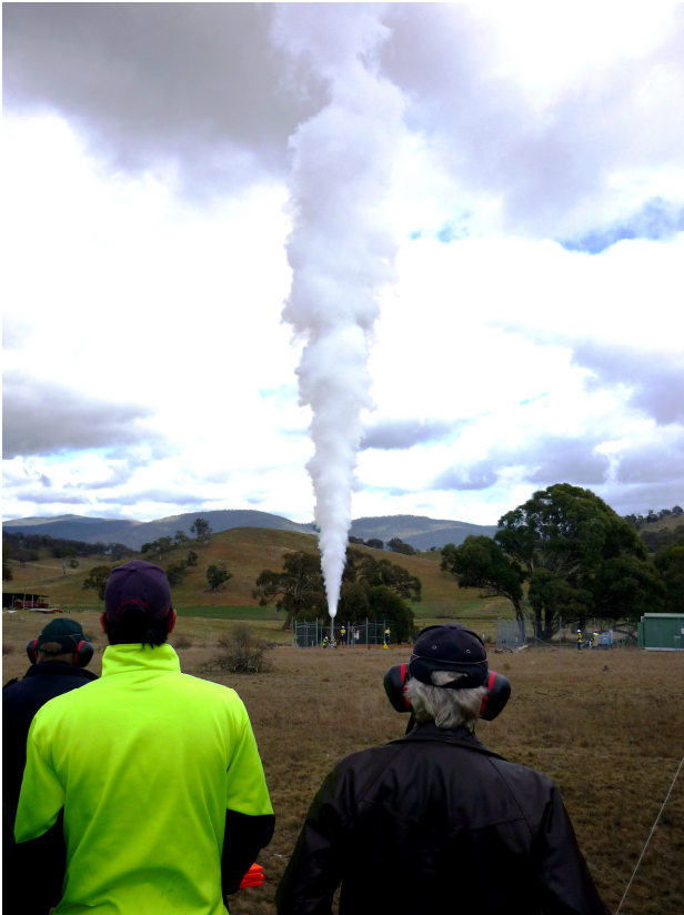
'Blowdown' on the Eastern Gas Pipeline

Newsletter of the Colinton Rural Fire Brigade * No 95* October 2009